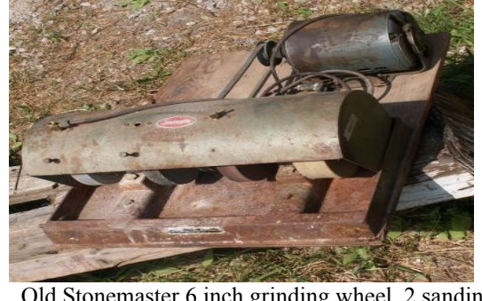
Old Stonemaster 6 inch grinding wheel, 2 sanding wheels, and 1 polishing felt. $125.00