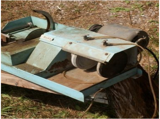
6 inch trim saw with two 6 inch grinding wheels. Motor runs. $125.00